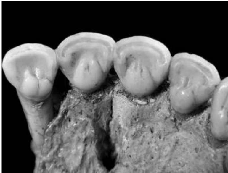
Fig. 1—Type of shovel shaping typically found in Neandertals (Krapina Maxilla E).

(8 mm and 10 mm), which fall outside the range of variation for Neandertals and are more than three standard deviations below the Neandertal mean ( table 1 ).